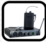
InEar Monitor V